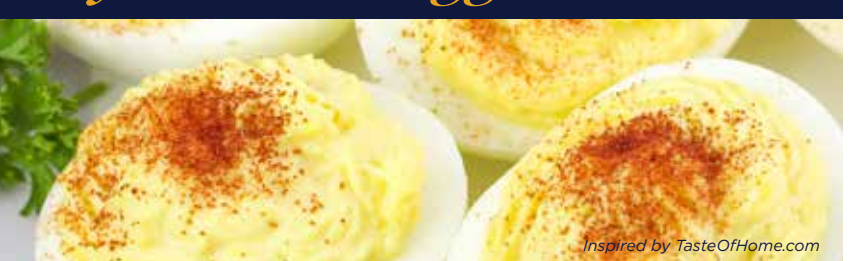
While the kids hunt for Easter eggs in the yard, whip up this easy deviled egg recipe for a hearty snack that's sure to satisfy any craving.